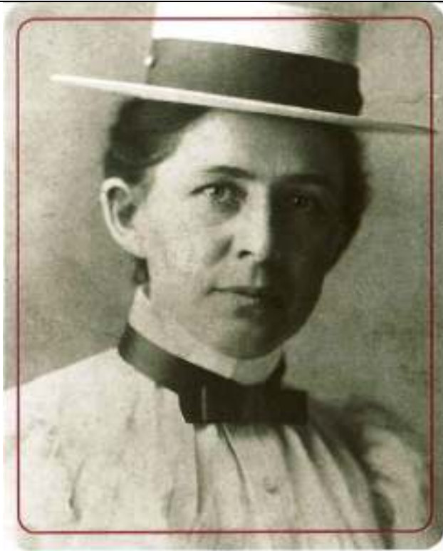
IDA TARBELL (American, 1857–1944)

Ida Tarbell is best remembered for the series of articles she wrote on the Standard Oil trusts for McClure's Magazine (published in book form in 1904) in which she exposed blackmail, price rigging, and other illegal practices by the company that then controlled 90 percent of the nation's petroleum supply. The articles not only led to dissolution of Standard Oil of New Jersey under the Sherman Anti-Trust Act but also helped shape the emerging trend of investigative journalism.