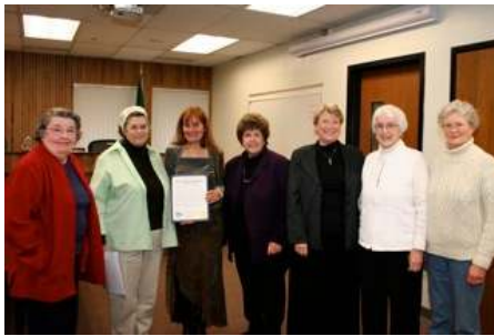
Thurston County 12/6/2011